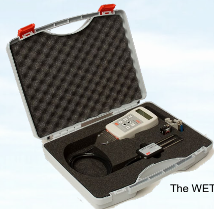
The WET Kit