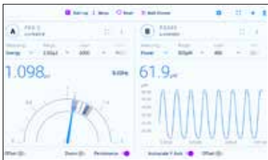
Two independent channels of measurement.