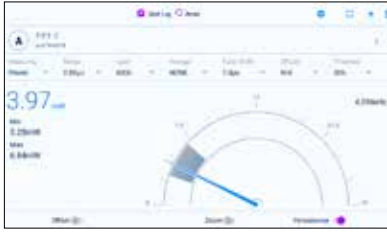
Analog needle display of power Persistence and min/max tracking.