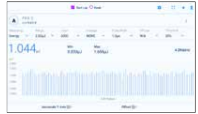
Pulse chart display of energy.