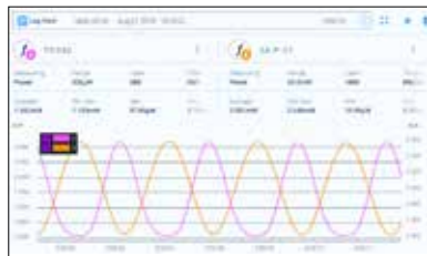
Two channels merging into one graph.