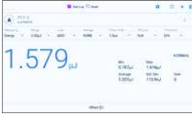
Display statistics of the present measurement session.