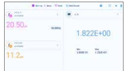
Two channels with a math comparison channel.