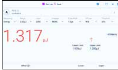
Pass/Fail screen. Excellent for QA purposes.